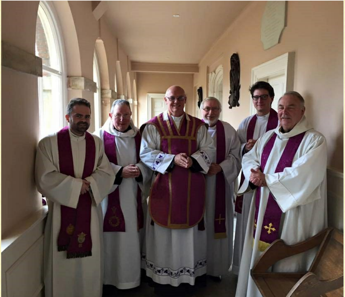
St John the Divine, West Worthing - ( stjohnwestworthing.org.uk )