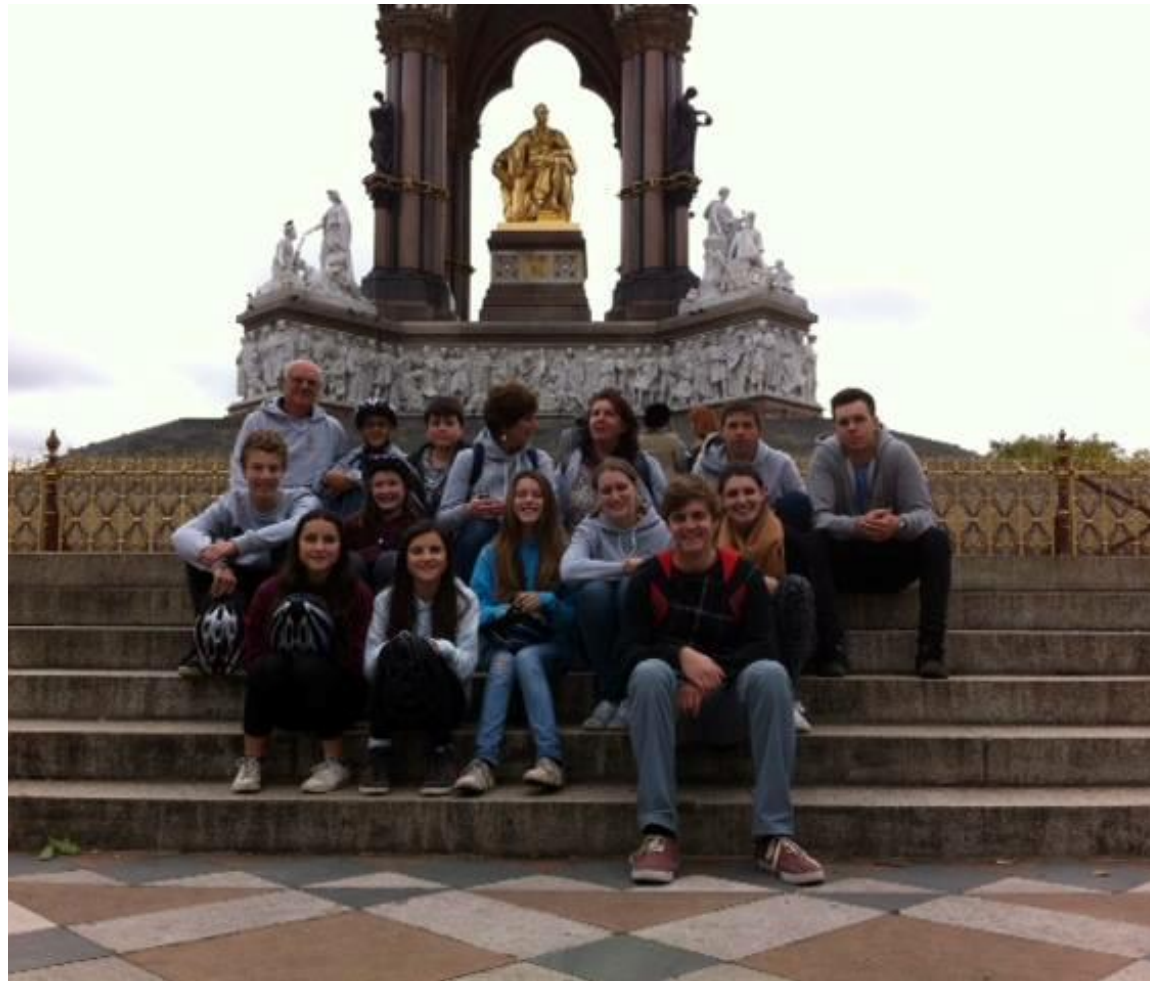
St John the Divine, West Worthing - ( stjohnwestworthing.org.uk )